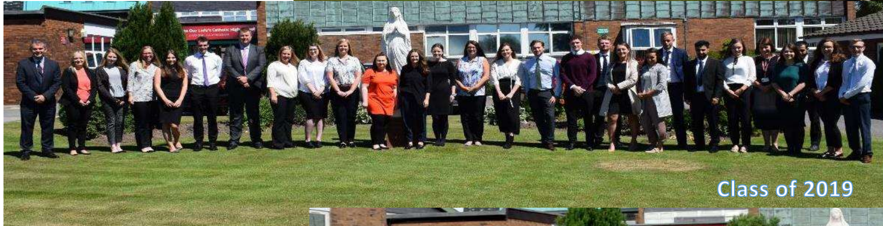
Class of 2019