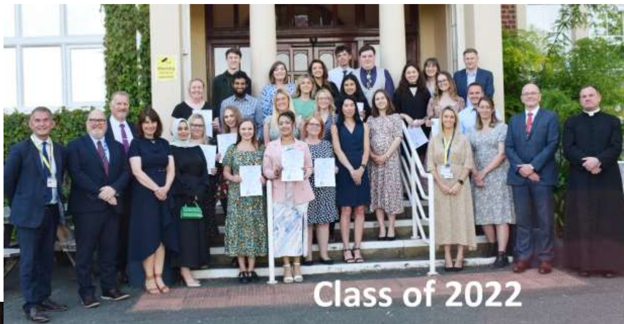
Class of 2022