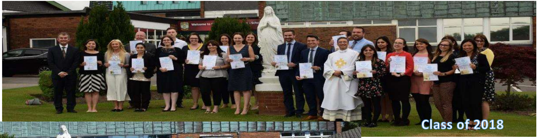
Class of 2018