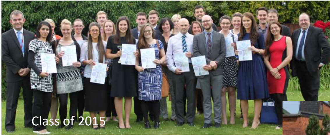
Class of 2015