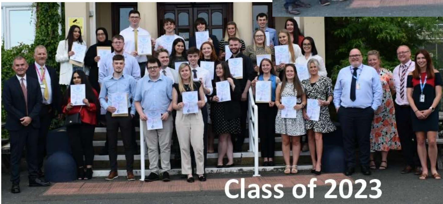
Class of 2023