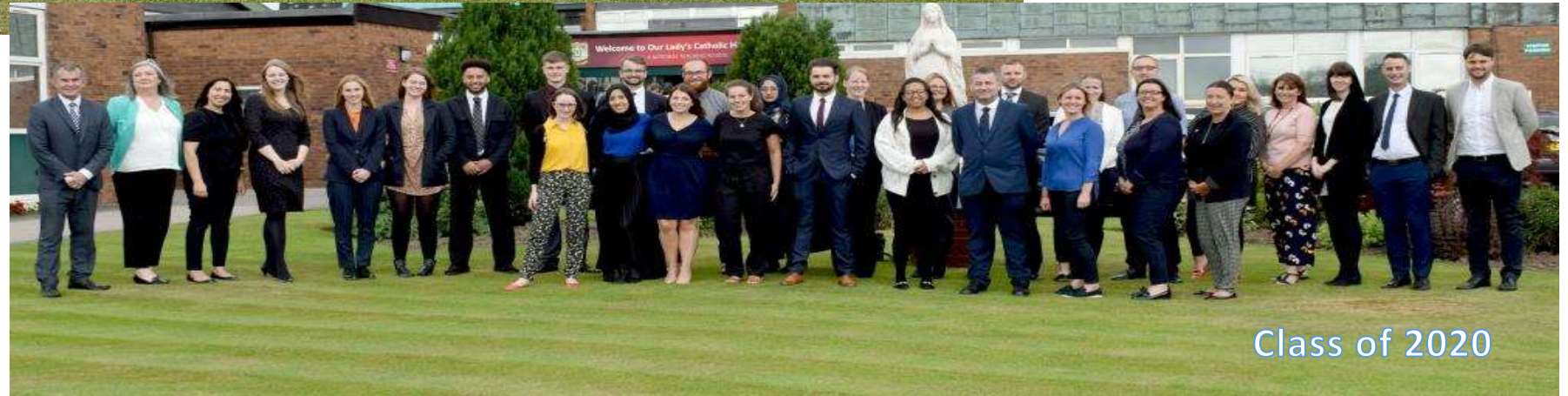
Class of 2020