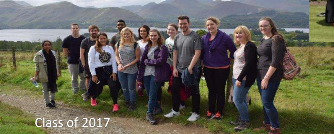
Class of 2017