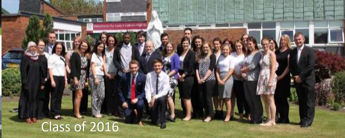
Class of 2016